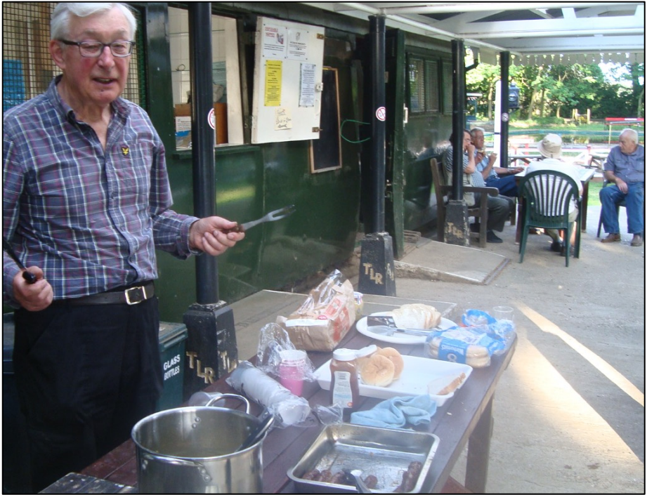
Roll up, roll up take your pick; cremated sausages or cremated sausages and a bun or a bun!

Soon it was time for the members present to take their purchases home to their workshops; having had both a satisfying BBQ and a fulfilling Auction, visually, materially and gastronomically.